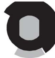
Correct stop cam placement in closed position